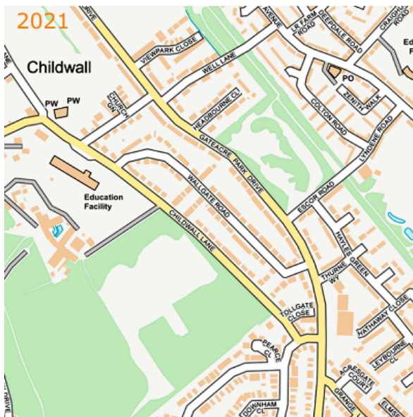
Above: An extract from OS Six-inch Map Sheets Lancashire CVII.SW & CXIV.NW (revision of 1925) and the present-day OS street map of the same area.